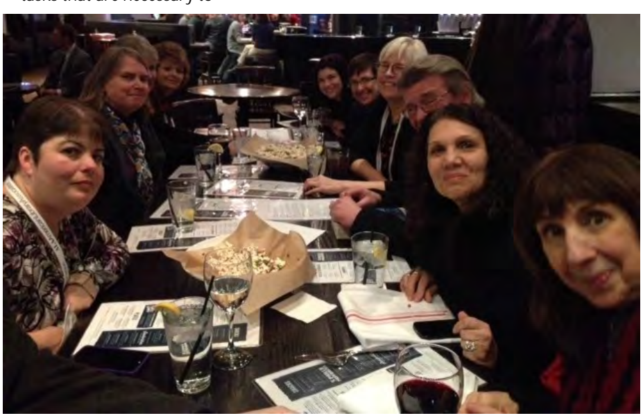
Beta Phi Mu members enjoying happy hour at ALA's Mid-Winter Conference in Philadelphia