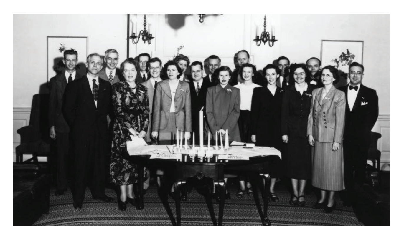
First Beta Phi Mu Initiation, 1948

The occasion marked the 70th anniversary of the founding of Beta Phi Mu at Illinois in 1948: