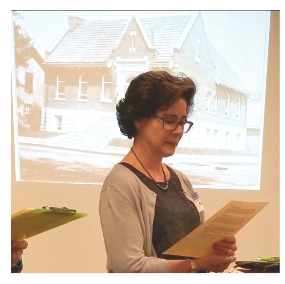
10 The Pipeline Dec. 2018 - Jan. 2019